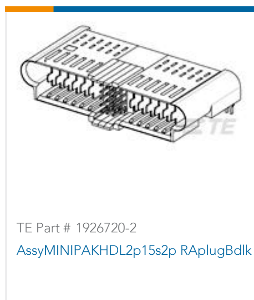
TE Part # 1926720-2 AssyMINIPAKHDL2p15s2p RAplugBdlk